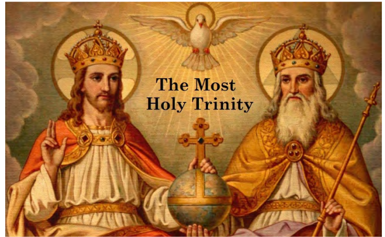
The Most Holy Trinity