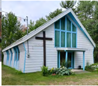
SACRED HEART CHAPEL