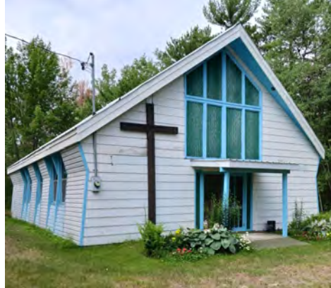
SACRED HEART CHAPEL